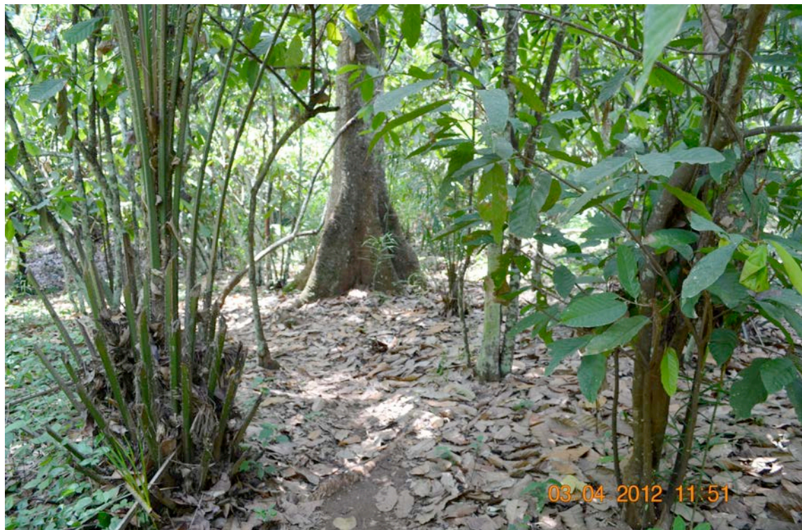
Fig. 6: An old but still productive and healthy cocoa plantation of an age of more than 80 years

The lifecycle of a cocoa tree can span well over a hundred years. Some few old but still productive and healthy cocoa plantations of an age of more than 80 years seen during the mission bare witness to this..