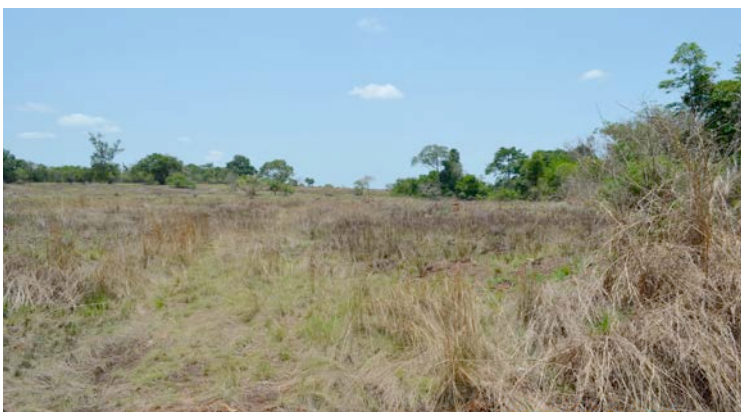
Fig. 5: Formerly primary forest has been converted into Savannah.

Therefore soil erosion and soil depletion will not be stopped by mineral fertilizer applications and increasing problems with pests and diseases will not be solved by spraying pesticides either.