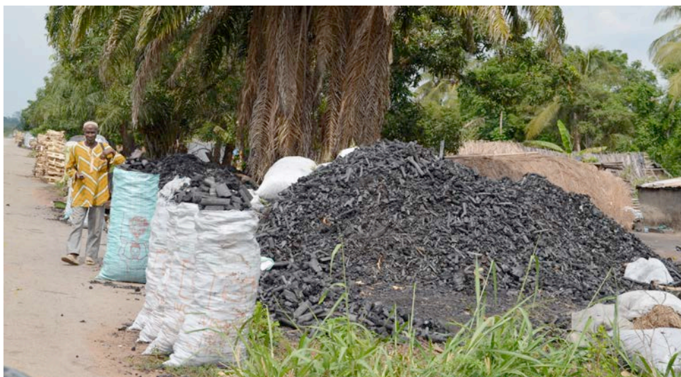
Fig. 2: Charcoal and firewood for sale

In the meantime productivity per ha has been in continuous decrease over the last decade from 700kg/ha in 2000 to 611kg/ha in 2009 (FAOSTAT 2011) and a huge amount of cocoa plantations are in a really deplorable situation. Production under full sun, lack of any management practices and the increase of pests and diseases may conduce to the collapse of cocoa production in the near future. As if this weren't enough, staple food production like yams, manioc, maize and peanuts are in crisis as well and are even in competition with cocoa for availability of land surface. Demographic growth and reduction of farm size due to partition of farms by inheritance will aggravate this situation more. And finally, a continuous export of energy from the field to villages, towns and cities in the form of firewood and charcoal combined with burning of all organic matter in the fields have lead to an energy crisis and lack of metabolic energy in the soil for further crop production.