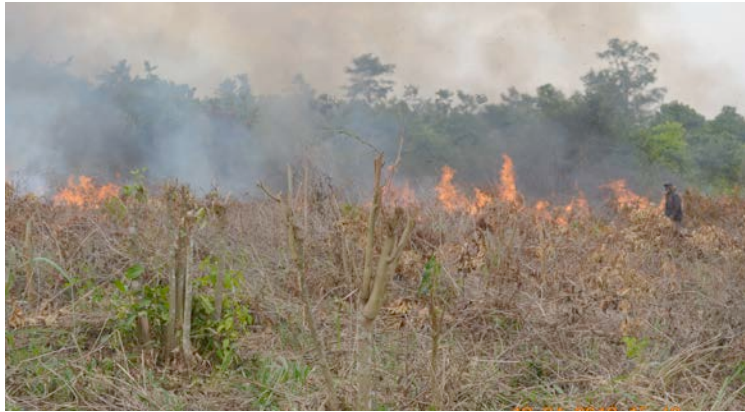
Fig. 3: Slash and burn

Vast areas of primary forest have already been converted into savannahs during the last decades, a process which is still going on at a rapid pace. One of the most commonly mentioned problems by farmers is the erratic rainfall distribution and the threat of drought due to local and global climate change.