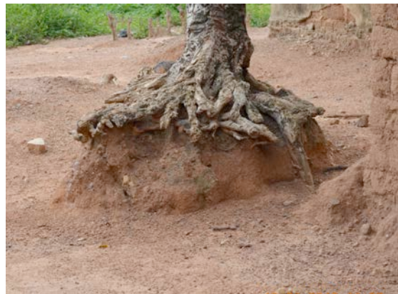
Fig. 4: Erosion in a community